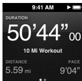
iPod nano (6th generation)

Nike + iPod automatically displays your workout status on the screen, similar to the following illustration. (Depending on your device type, the screen may appear slightly different.)