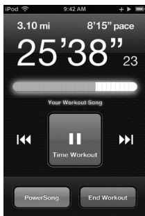
iPhone 3GS or later and iPod touch

Nike + iPod automatically gives you spoken feedback on your progress during your workout (see "Getting Spoken Feedback" on page 17). You can also get feedback whenever you want it.